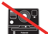
new Polaroid i-Type cameras

Have a problem, or a question you need answered? USA/Canada usa@polaroidoriginals.com 1-212-219-3254